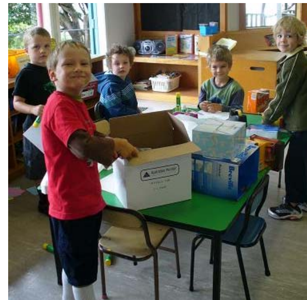
Tautoru students having fun at their Developmental Morning and Māhutonga students, acting as newsreaders, at Assembly last Thursday.